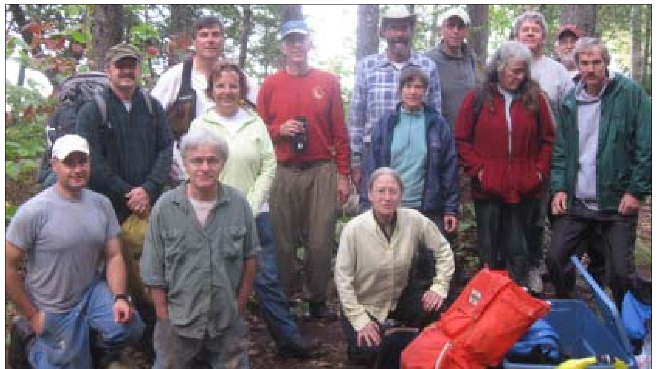
Kennebec District volunteers